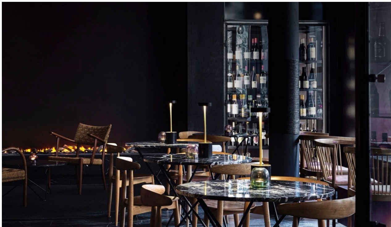
Restaurant – guest can dine and charge