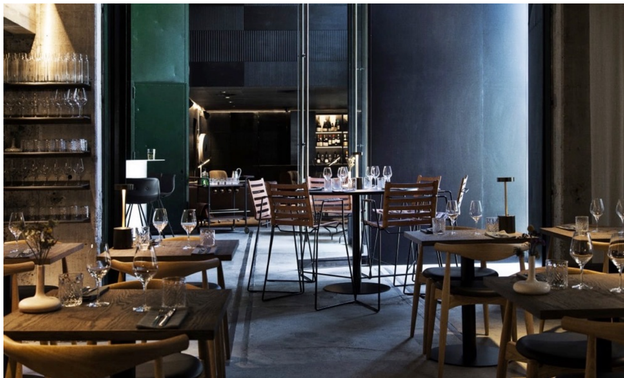
Cafe – guest can dine and charge