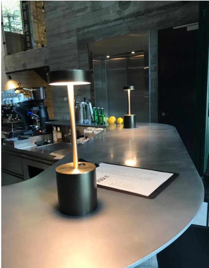
Bar – guest can chill and charge