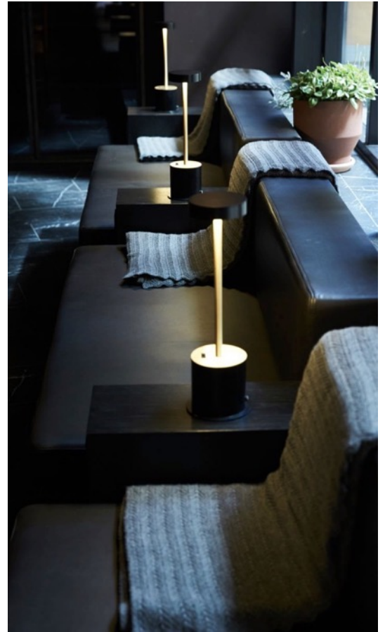
Lobby – guest can chill and charge